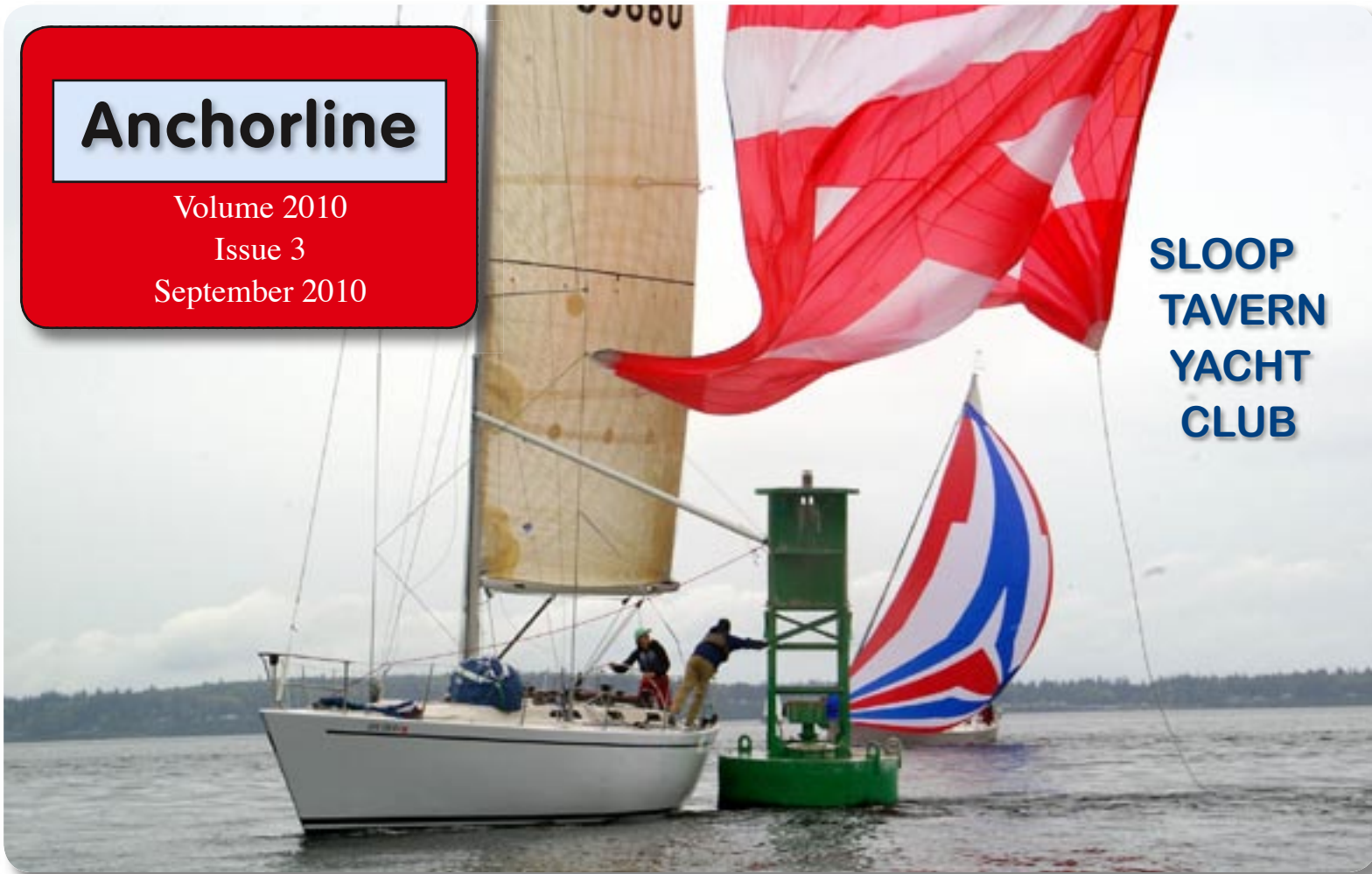
Race to the Straits - 2009